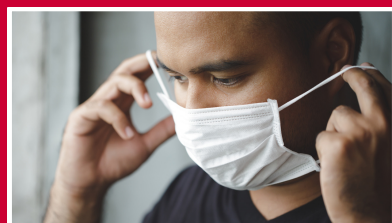
Post-Pandemic Policy Perspective Series Summer 2023

At the Center, we like to keep busy. Here is a glimpse of what we are working on: