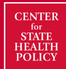
Celebrating CSHP's 25th Anniversary Fall 2024